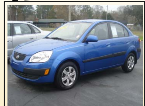
2009 KIA RIO GREAT MPG $1000 DOWN