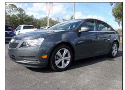
2013 CHEVROLET CRUZE 2LT $15,990 STK#: 114755