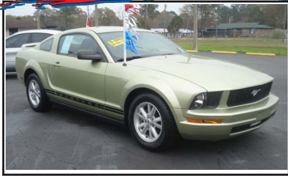
2005 FORD MUSTANG VERY NICE MUST SEE $1500 DOWN