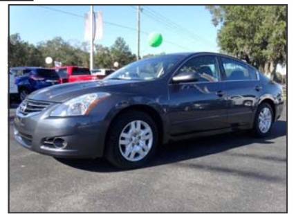
2012 NISSAN ALTIMA $16,990 STK#: 235008