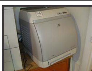
HP 2605 DN, duplex, network Color laser Printer, prints light may need toner, very good condition used very little. using in clean office enviroment...$55 at Showcase Advertising 904-964-6463