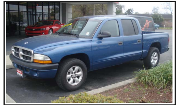
2004 DODGE DAKOTA CREW CAB $1000 DOWN