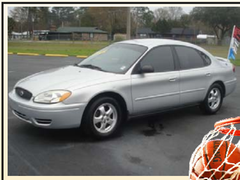
2005 FORD TAURUS GREAT FOR THE FAMILY $1000 DOWN