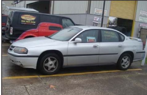
2003 CHEVY IMPALA, AT, AC $3250 CALL 904-769-9754.