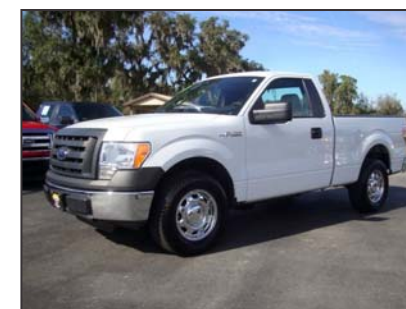
2010 FORD F150 XL $16,990 STK#: A49806