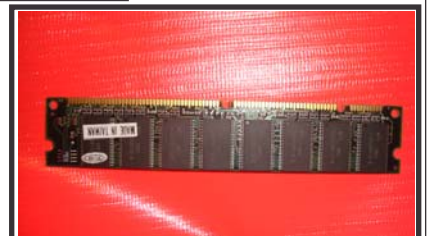
PC2100 512MB DDR2 $10 or offer or trade ..... 904-263-0008