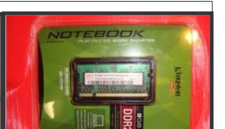
Laptop memory DDR@ 512MB...$10 or offer or trade.... 904-263-0008