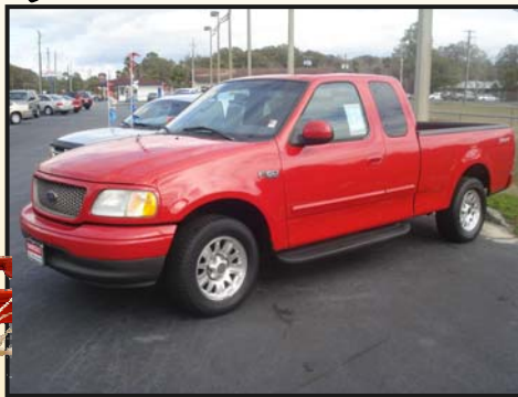
2002 FORD F150 XLT AUTOMATIC, SUPERCAB $1300 DOWN