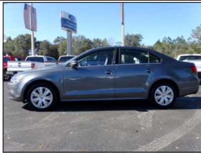
2013 VOLKSWAGEN JETTA 2.5 SE $14,990 STK#: 369721