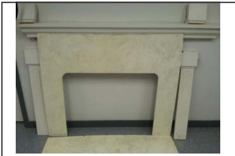
USED MARBLE FP SURROUND & HEARTH, MANTLE & SIDE POSTS $45 OBO 352-258-3040