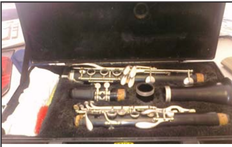
LeBLANC CLARINET W/PADDED CASE & CLEANING KIT $150 OBO COST $500+ 352-258-3040