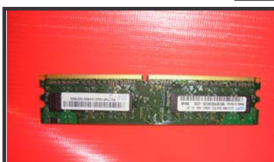
Samsung memory chip Pc4200 512MB DDR2 $10 or offer or trade ..... 904-263-0008