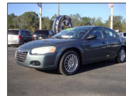
2006 CHRYSLER SEBRING TOURING $5,995 STK#: 247926