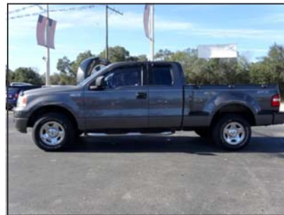
2005 FORD F150 STX 4X4 $13,990 STK#: B73618