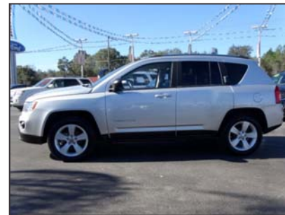
2011 JEEP COMPASS SPORT $16,990 STK#: 142463