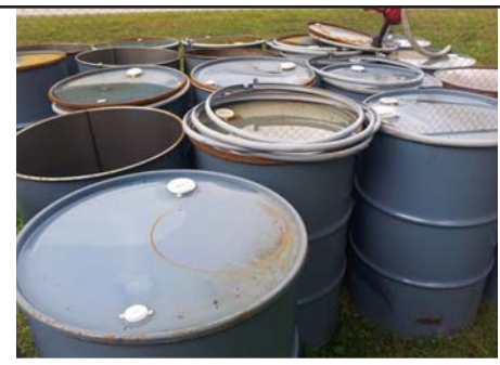
BARRELS WITH RIMS CALL ME 964-2974.