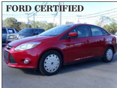
FORD CERTIFIED 2012 FORD FOCUS SE $16,990 STK#: 265791