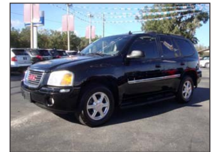
2007 GMC ENVOY SLT $12,990 STK#: 106551