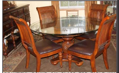
BEAUTIFUL ROUND 54" GLASS TOP TABLE W/4 PADDED CHAIRS, PINEAPPLE BASE, GORGEOUS $175 352-473-5704.