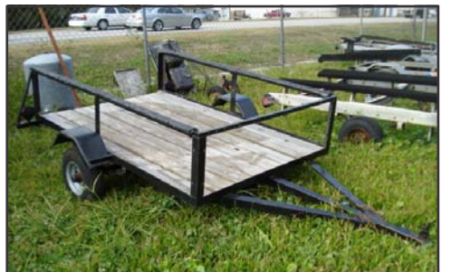
4X8 UTILITY TRAILER $275 CALL 904-964-2974 FOR MORE INFO