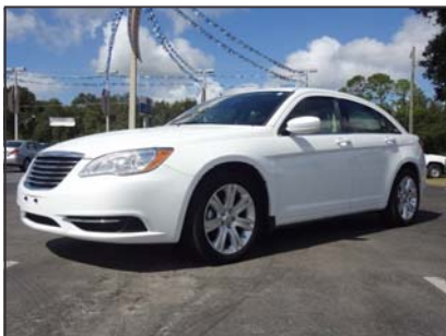
2012 CHRYSLER 200 LX $12,990 STK#: 184343