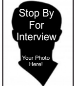
Stop By For Interview Your Photo Here!