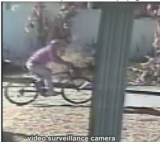
video surveillance camera

Does his stealing mostly on Westmoreland St., Starke. short man 38-45, 10-15 speed bike with basket in front, wears cell phone on hip (right side), wears faded jeans