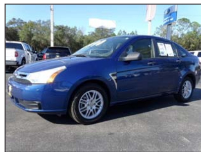
2008 FORD FOCUS SE $6,990 STK#: 108930