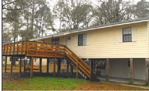
1200 SF, 3BR, 1BA COMPLETELY RENOVATED IN 2012 FROM FLOOR TO CEILING. MOVE IN READY $115,000 904-364-3152