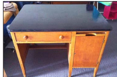
ANTIQUE DESK $75 OBO 352-258-3040