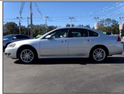
2013 CHEVROLET IMPALA LTZ $15,990 STK#: 181975