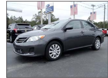
2013 TOYOTA COROLLA LE $13,990 STK#: 80518