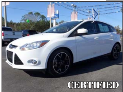
2012 FORD FOCUS SE $18,990 STK#: 377936T