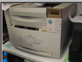
HP 4500 , networkable Color laser Printer, prints light may need toner, very good condition used in clean office enviroment $100....at Showcase Advertising 904-964-6463

information leading to whereabouts of this theif & arrest can earn you a reward. See more movies of him in action on multiple days at Showcase Office. Or call 904-263-0008.