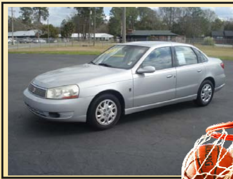
2003 SATURN LS MODEL $500 DOWN