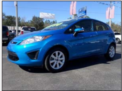
2013 FORD FIESTA SE $13,990 STK#: 114016