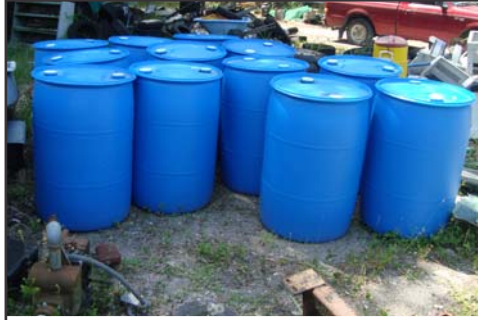
BLUE PLASTIC BARRELS CALL 964-2974