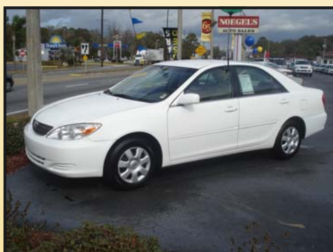
2003 TOYOTA CAMRY 4 DOOR SEDAN $1200 DOWN