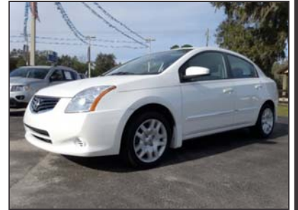
2011 NISSAN SENTRA $14,990 STK#: 657023