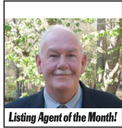
Listing Agent of the Month!