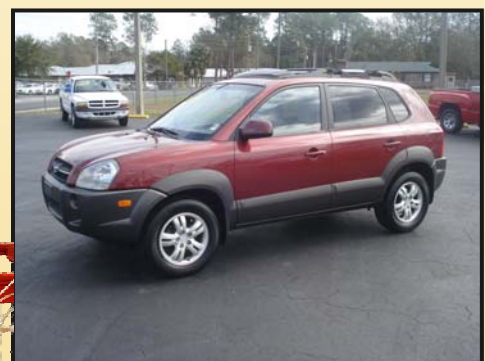
2006 HYUNDAI TUCSON 4 DOOR SPORT UTILITY $1000 DOWN

"Customer Satisfaction Has Been Our Top Priority Since 1947"