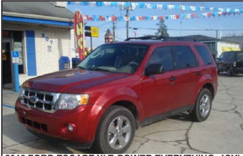
2012 FORD ESCAPE XLT, POWER EVERYTHING, 4CYL 30+ MPG, HEATED SEATS, MOONROOF, LADY DRIVEN 20K MILES METALLIC RED $18,900 904-964-7138