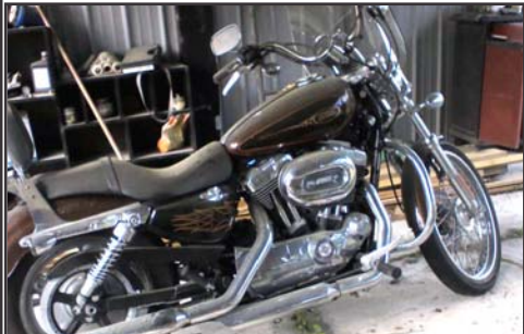
2009 HARLEY CUSTOM SPORTSTER 1200, 11K MILES, CANDY ROOTBEER $6000 904-964-8545