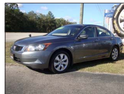
2008 HONDA ACCORD EX $12,990 STK#: C038400