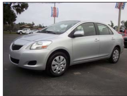
2012 TOYOTA YARIS L $11,990 STK#: 37716