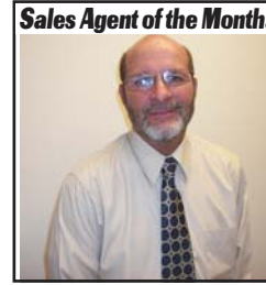
Sales Agent of the Month!