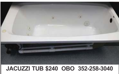
JACUZZI TUB $240 OBO 352-258-3040