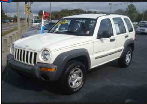
2003 JEEP LIBERTY AUTOMATIC, 4 DOOR SPORT $1200 DOWN